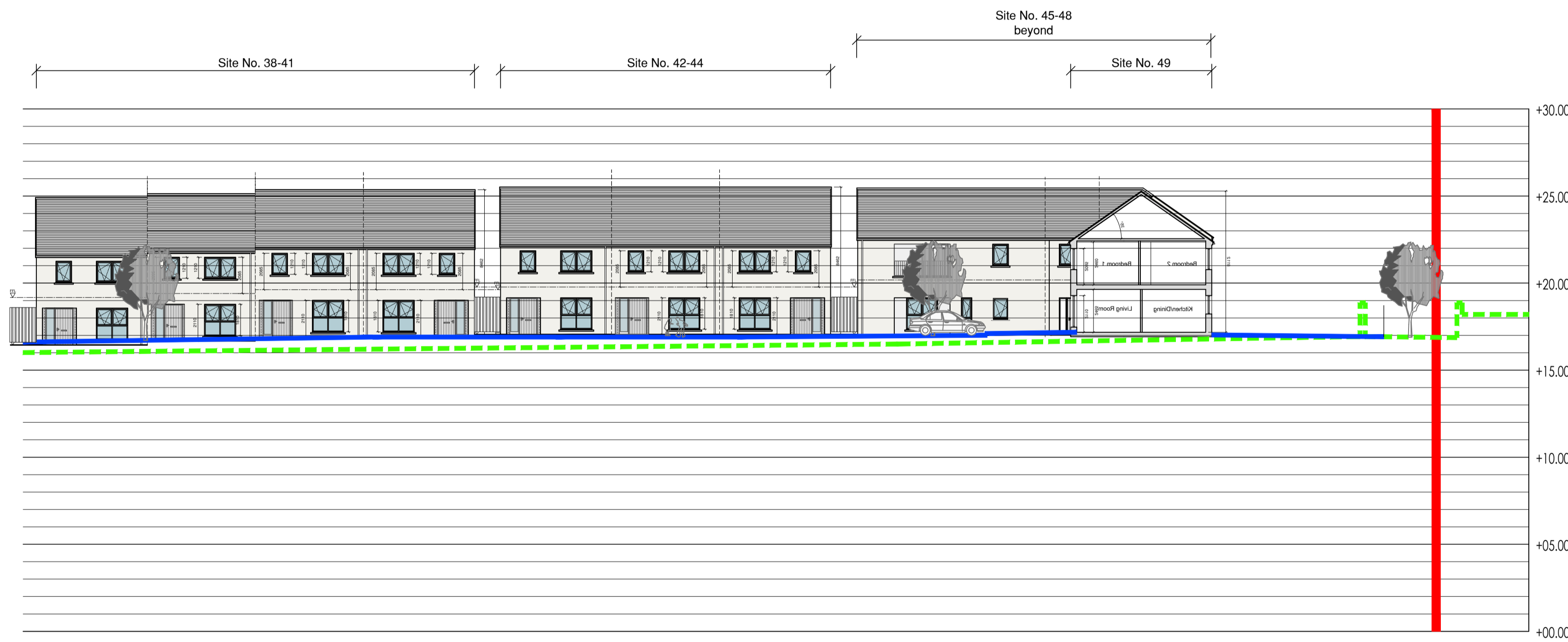
Site Section E-E Cont'd

Existing Ground Levels - - - - - Proposed Ground Levels ————— Application Boundary —————